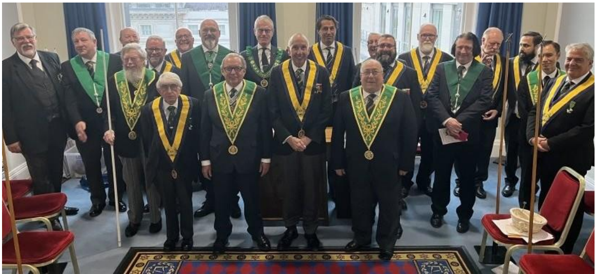
Two days later, on 26th September, members of Rose & Lily No. 15 , held what was